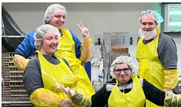
Job Training Students at Heinen's in Chardon