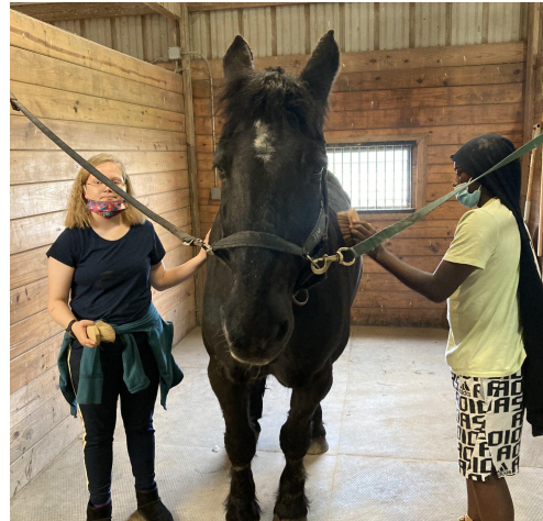
Gaitway High School Students