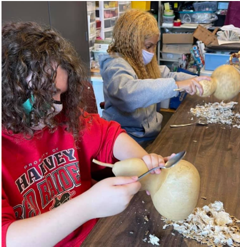
Unique Like Me Students